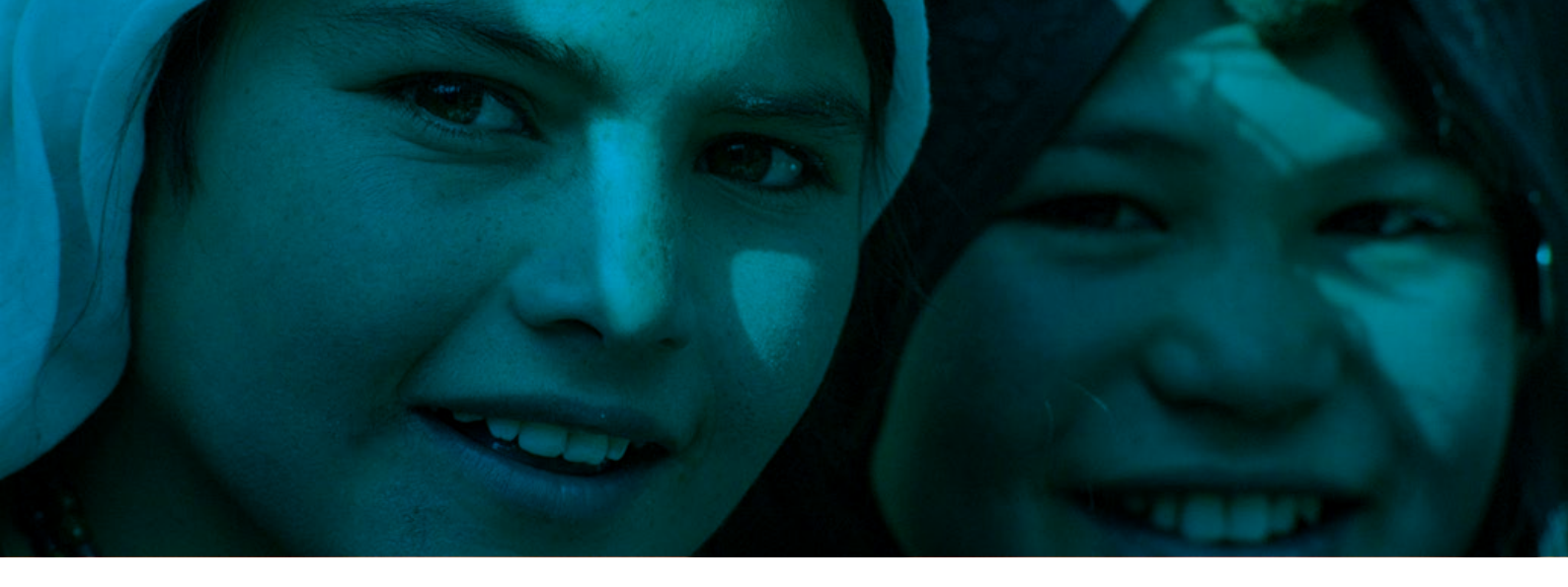
Afghan kids in Maslakh, near Herat.

Transparency has been a persistent priority during Spain's term. Explaining our actions has been an inherent characteristic of our duty.