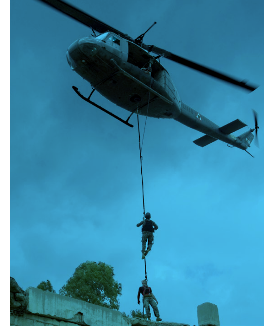
UNIFIL troops throughout training tasks in Lebanon.

Joint Investigative Mechanism (JIM) on the Use of Chemical Weapons in Syria was renewed twice. As co-penholders of the humanitarian dossier, we have promoted the adoption of Resolutions 2328 and 2332, and A/RES/71/130. Spain has fully endorsed the work of the UN Secretary-General's Special Envoy for Syria and worked within the International Syria Support Group (ISSG) to bring hostilities to an end. Spain's good offices during its presidency in December enabled the adoption of Resolutions 2328 and 2336, which takes note of the ceasefire agreement between Turkey and Russia.