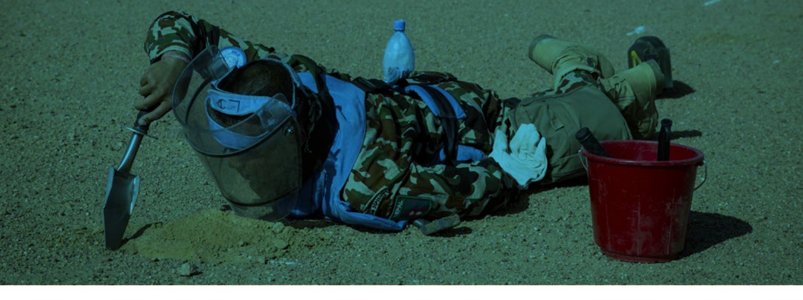
A blue helmet from the MINUSMA's Nepalese contingent works on the demining of the airstrip in Kidal (northern Mali).

the International Contact Group and the leadership of ECOWAS and the Community of Portuguese Language Countries (CPLP) in management of the crisis.