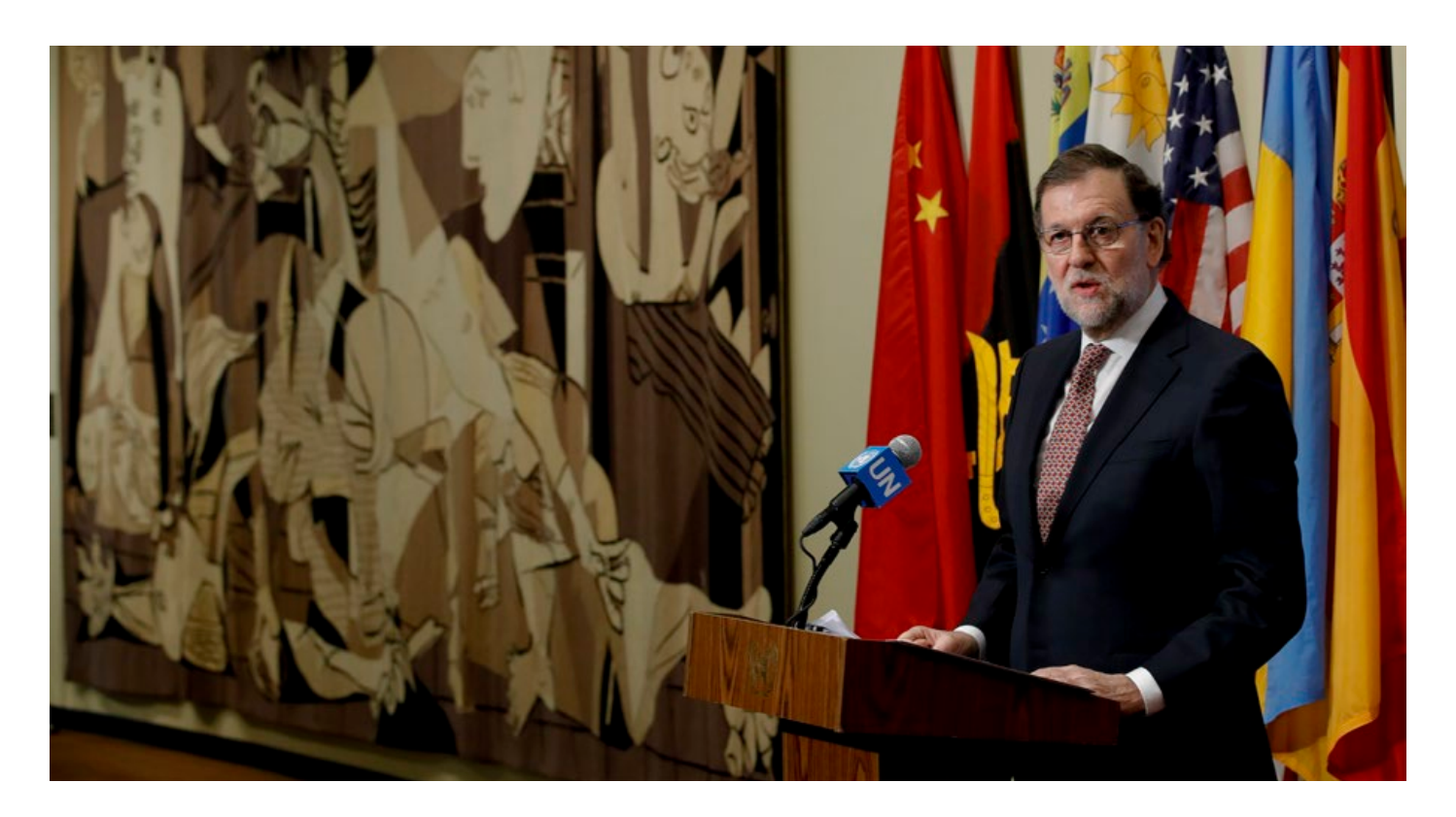
The President of the Government stands before the press after presiding over a session of the Security Council in December 2016.