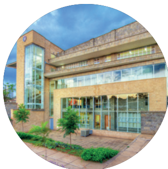
Strathmore Business School

Lagos Business School is a leading institution in Africa dedicated to creating and transmitting business and management knowledge relevant to emerging markets. Located in Africa's second largest city, Lagos, LBS delivers executive education at top, middle and junior management levels, aiming to systematically improve the practice of management on the continent. We offer a wide selection of open-enrolment and executive programs prepared around essential issues in business. Customized in-company programs are also designed for organizations that need to develop large groups of staff in a particular discipline.