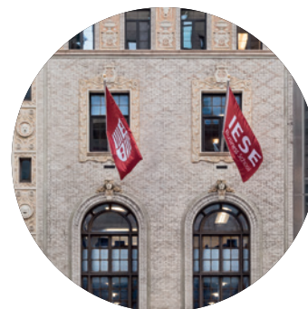
IESE Business School

In 2005, Strathmore University made a bold step; to start a business school that served leaders in positions of influence in society. It is our belief that when leaders are positively impacted, the ripple effect will be felt in the society at large. Strathmore Business School has served and influenced over 8,500 business leaders, policy makers, professionals and thought leaders across the continent. It is SBS's mission to develop transformative business leaders because the bewildering rate of change in new ethical and governance challenges increases the demand for great ethical leaders with a passion for excellence.