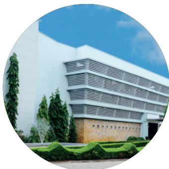
Lagos Business School

Individuals will be granted Alumni status in all three of the schools and will be invited to join as members of the respective Alumni associations.